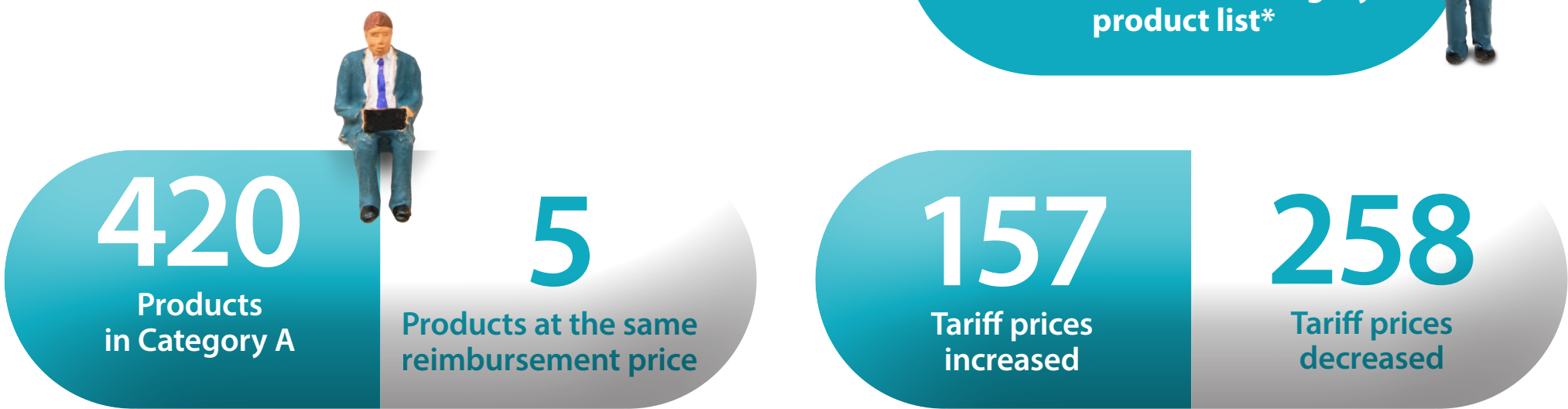
Number of Products in Category A

These figures are based on the products in Category A for this month.