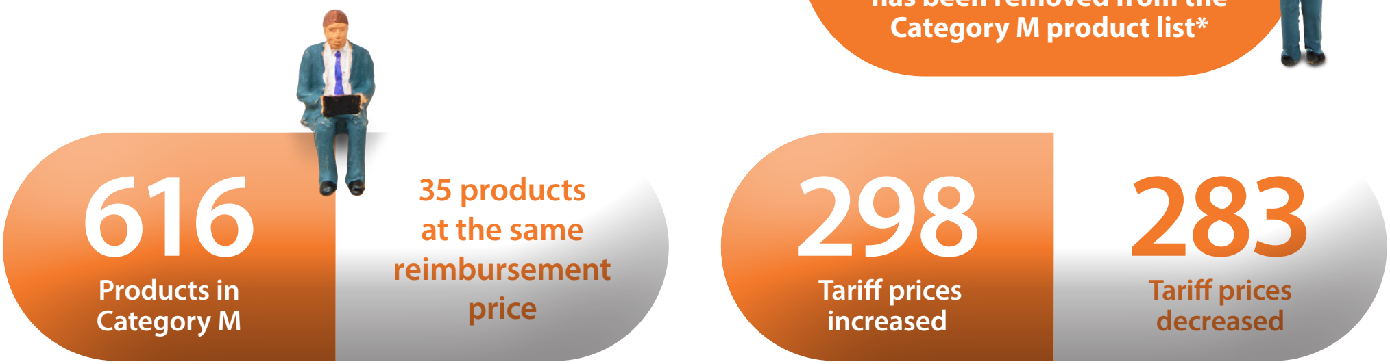
Number of Products in Category M

These figures are based on the products in Category M for this month.